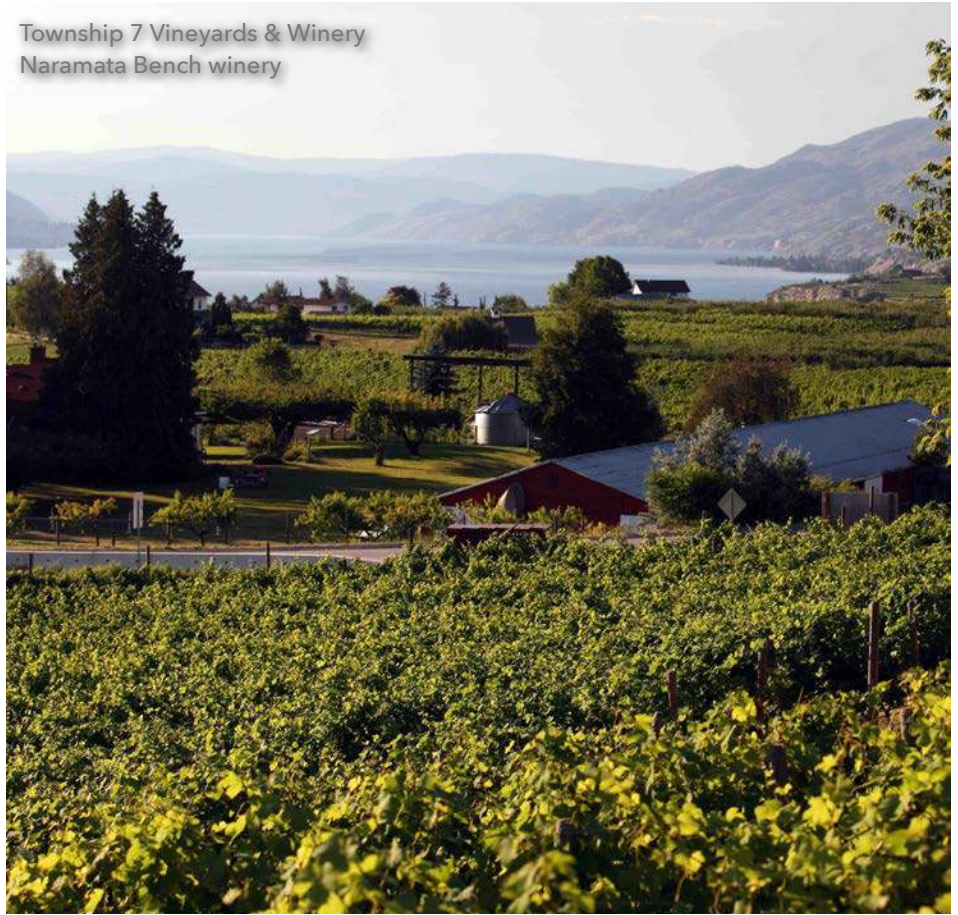
Township 7 Vineyards & Winery Naramata Bench winery

At Township 7 it's about quality wine. No trinkets, no accessories, no restaurant, only wine!